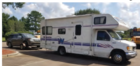
The "new" travel rig - 1996 Mini Winnie

great strides in reviving that good work. They have already seen growth in their attendance and held their first "Faith Promise Missions Conference." Ministry is so much more than just preaching! I am thankful for the lifetime of varied ministry experiences that God has given me which has equipped me with many tools to help local churches.