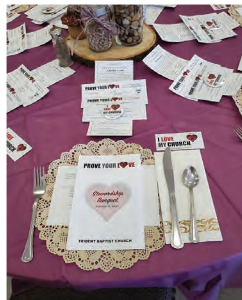
Graphic design elements for the banquet