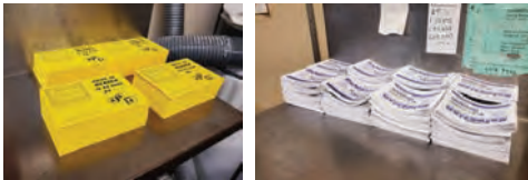
Our salvation booklets and children's tracts on the cutter at Parker Memorial Printing Ministries

books, booklets, book cover design, and anything else you can dream up! We have the capacity to print many things in-house. For larger projects we have connections with printing ministries to complete the work following our design process.