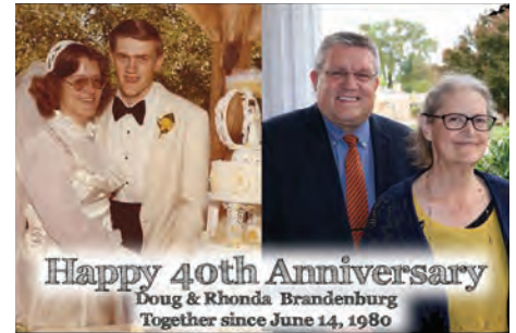
As you can see, we haven't changed a bit!